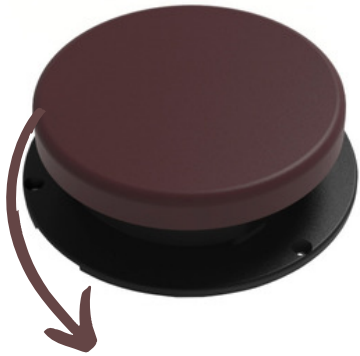
8.63CM ACTIVATION SURFACE

GS05 Press Switch 100gr has a 100gr activation force while GS06 Press Switch 150gr and GS07 Pillow Switch have 150gr. Made from durable materials, the switches can be used with different mounting systems, tiny screws or double-sided tapes. Likewise, Pillow Switch enables the users to use touch fastener straps or safety pins to secure the item on fabric surfaces.