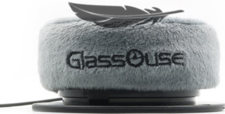
REMOVABLE SOFT CUSHION

Known as a game-changer device in assistive technology industry, GlassOuse Assistive Device adds a new member to G-Switch Series and expands its compatibility with three adapted switch options. As separate switch controls, newly launched Press Switch 100gr, Press Switch 150gr and Pillow Switch are fully compatible with the latest GlassOuse generation, V1.2 and also other adapted devices and systems using switch access.